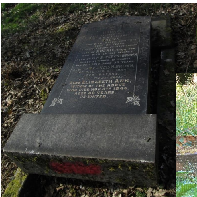
The Brown headstone laid flat on plot L17.

In March 2016 this gravestone was turned over to reveal its memorial inscription. Later it was restored to an upright position.