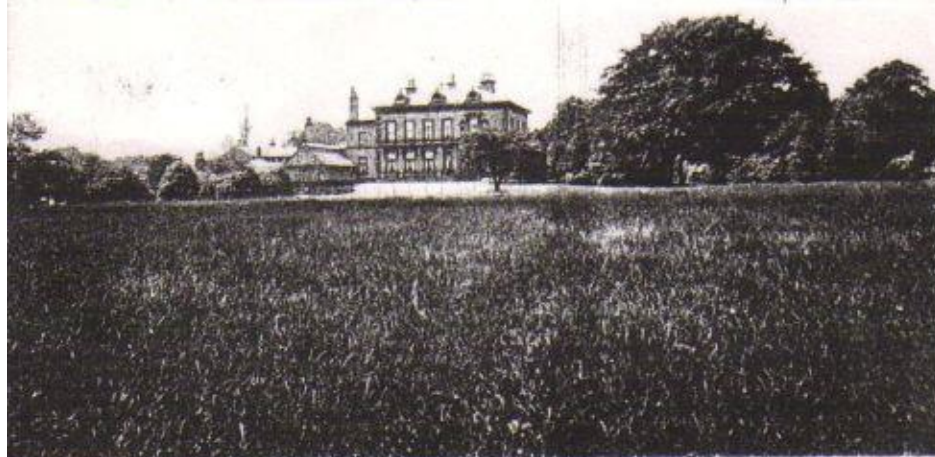
Sagesse Convent, Grassendale, Liverpool.