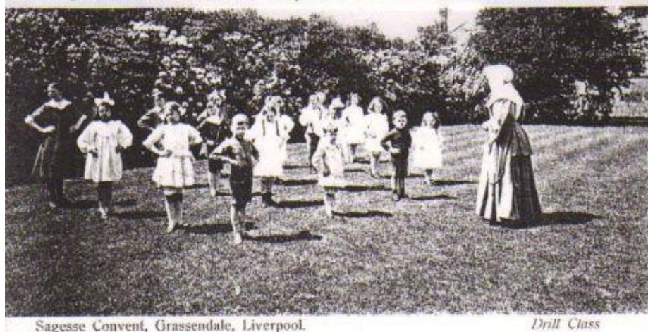
Sagesse Convent, Grassendale, Liverpool.