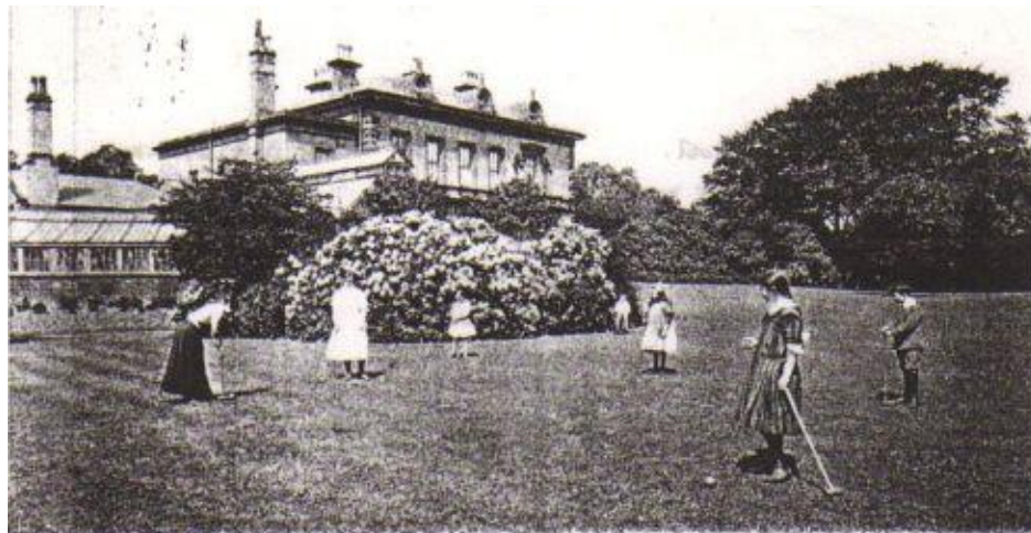
Sagesse Convent, Grassendale, Liverpool.